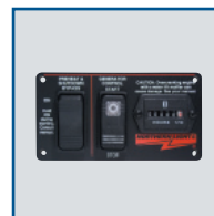
Length - 5.5" x Height - 2.88"

S-1 Panel. Includes: run light, start/stop and shutdown bypass, preheat switch (L: 3.38" x H: 2.88")