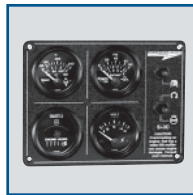
Length - 7" x Height - 5.25"

S-3B Panel. Includes: DC voltmeter, water temperature gauge, oil pressure gauge, engine hourmeter, start/stop, and shutdown bypass/preheat switch. Includes a NMEA compliant enclosure (L: 10" x H: 8" x D: 4")