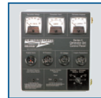
Length - 14" x Height - 17" x Depth - 6.25"

Includes: Engine temperature gauge, DC volt meter, AC voltmeter, AC frequency meter, AC ammeter with harness, oil pressure gauge, start/stop, and shutdown bypass/preheat switch. Available as flush mount or with enclosure (L: 14" x H: 17" x D: 6.25")